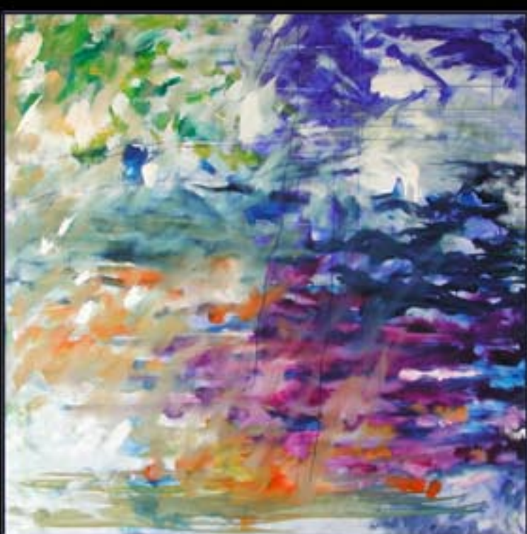
Brett Weber will display his paintings at Cedar Crest College, including this one called "Escape Subtitles: Dreams, Report, Disease," a colorful oil and acrylic painting on canvas, 3.75 feet high and 11.25 feet wide.